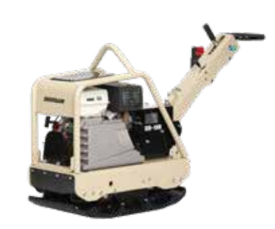
BXR-60H | BXR-100H | BXR-200H | BXR-300H