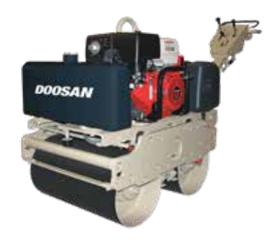
SX-170H | DX-500E | DX-600H | DX-600E | DX-700H | DX-700E