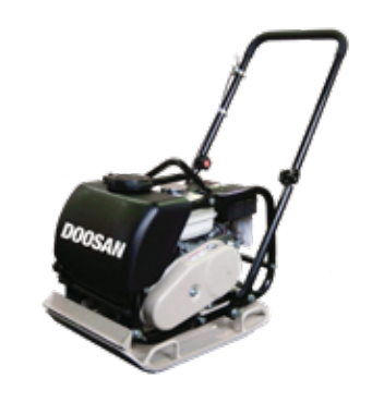
BX-60WH | BX-80WH | BX-120WH | VP-8RH