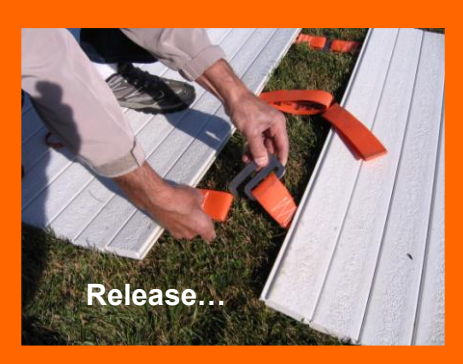
Disconnect 25' Sections as Needed Trax can be Maneuvered on Ground to Achieve Desired Coverage