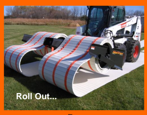
Dispense Trax<sup>™</sup> (100' in 2 minutes)