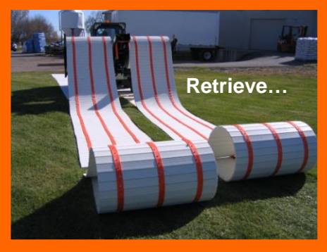
Connect Trax to Spool Harness - Back up and Begin Roll up of Trax onto Spools