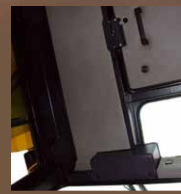
Cab roof window provides t all operations while the emo provides operator's s