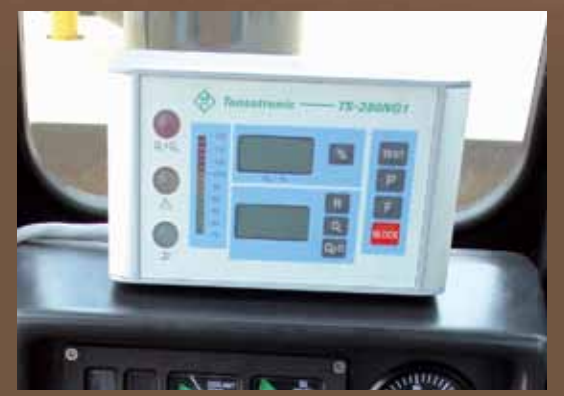
Optional electronic safe load indicator (ESLI) shows necessary load handling information.